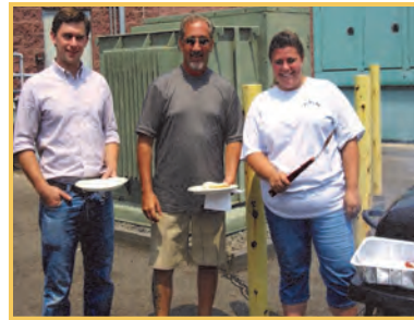
Braving the heat of the Sun & the Grill!

PARS held the First Annual Client/Employee Summer BBQ on the 22nd of July in the Robbinsville, NJ Office. The event was a great success despite intense heat and