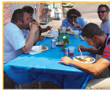
Enjoying great food and company!